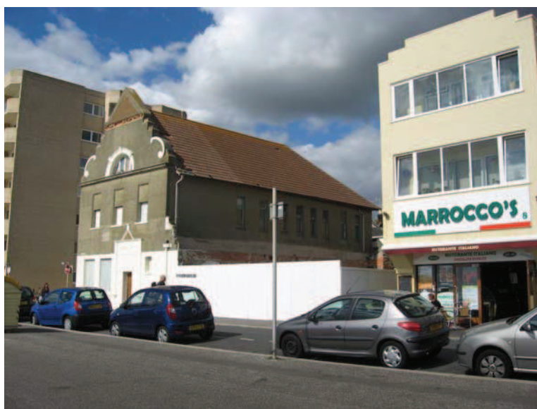
The south elevation of the Medina House site and its immediate surroundings, Kings Esplanade, Hove

The site is located on the seafront promenade of Kings Esplanade, Hove between the junction of Sussex Road to the west and the Victoria Cottages twitten to the east.