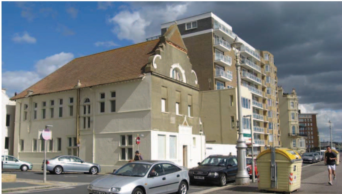
The South West Corner of Medina House and Cliftonville Conservation Area, looking eastwards along Kings Esplanade, Hove

These relatively small scale buildings and terraces are bounded to the west and east by larger, 7 to 9-storey purpose built flats, which include Bath Court to the west of Medina House - an 8-storey redevelopment of the western section of the original Hove (Medina) Baths complex fronting Kings Esplanade and the western corner of Sussex Road. The building height of Bath Court falls back to 3 storeys along the south west side of Sussex Road. Medina House marks the south west corner of the Cliftonville Conservation Area, the boundary of which runs northwards up Sussex Road, encompassing the 2-storey terraced houses fronting the western elevation of Sussex Road but excluding the Bath Court development.