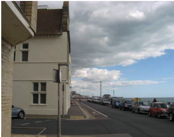
The south west corner of the Medina House site Kings Esplanade, Hove looking eastwards toward Brighton