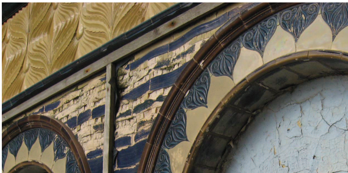
Some of the remaining original ceramic tiles used to decorate the former swimming baths at the Medina House site, Hove

The primary development opportunity at the Medina House site is as a residential scheme with the reuse and retention of Medina House as a core feature. Other potential land uses appropriate to its seafront context may be possible. The council's key concern is the preservation and contextual setting of Medina House and it will adopt a flexible approach to proposals that support this objective.