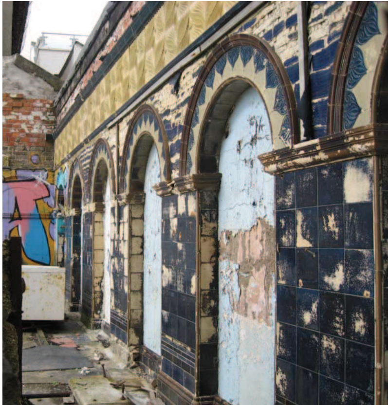
Original ceramic tiles attached to the north east wall of the former swimming baths, Medina House site, Kings Esplanade